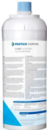
Head sold separately.

CLARIS ULTRA 1000 FILTER CARTRIDGE: 4339-82